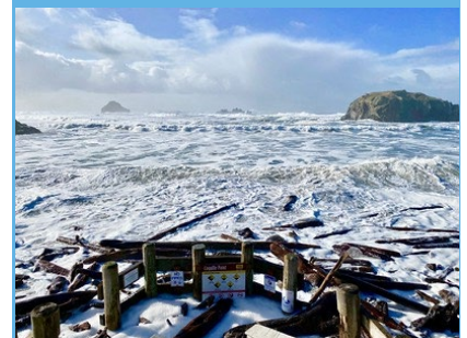
Coquille Point, Bandon, OR during a king tide.